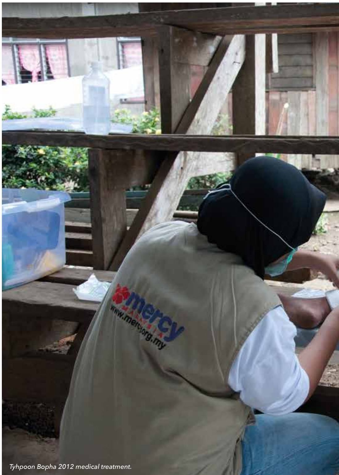
Typhoon Bopha 2012 medical treatment.