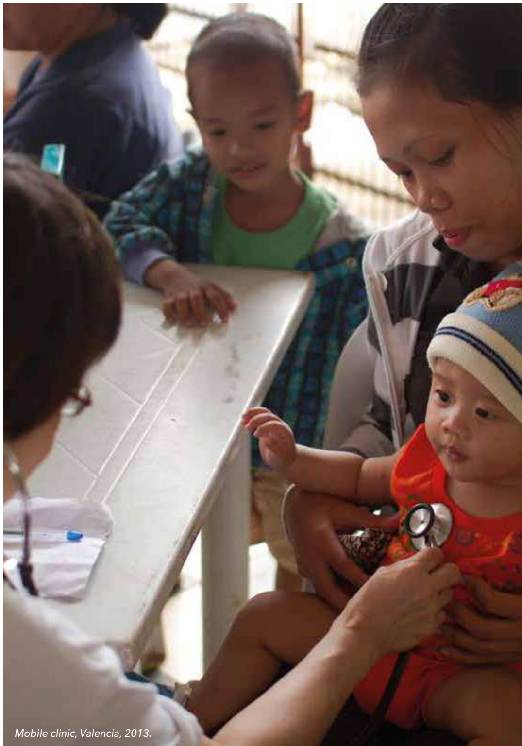
Mobile clinic, Valencia, 2013.