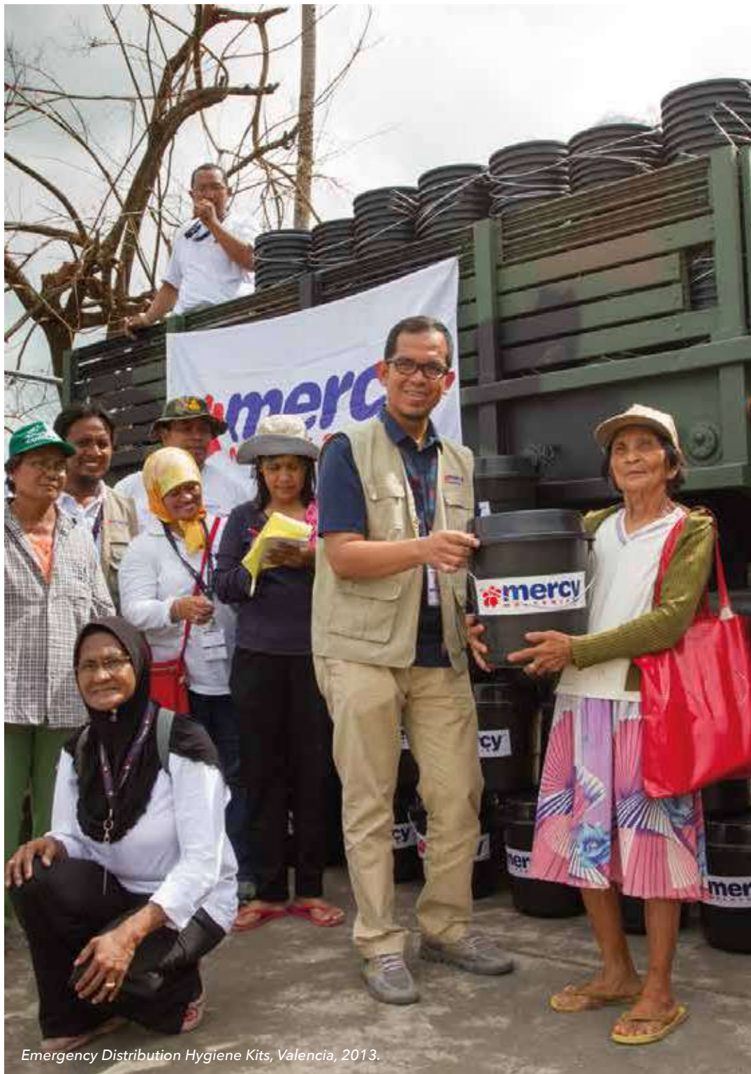
Emergency Distribution Hygiene Kits, Valencia, 2013.