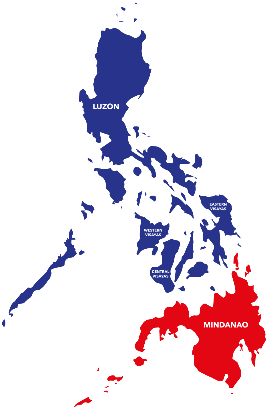
MERCY Malaysia's footprints in the Philippines.