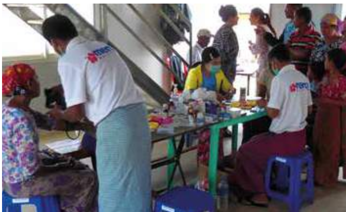
Location: Sittwe, Rakhine